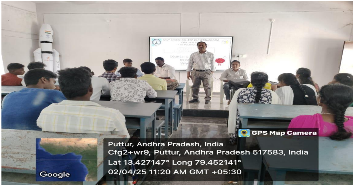
The college principal addresses the students at the Valedictory programme of the e-Governance Certificate Course held under the auspices of Political Science.