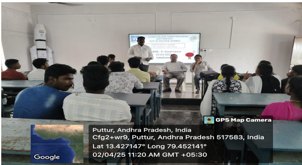
The college Political Science faculty addresses the students at the Valedictory programme of the e-Governance Certificate Course held under the auspices of Political Science.