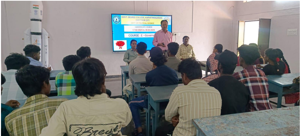
The College Principal addresses the students after launching a certificate course in E-Governance under the auspices of Political Science